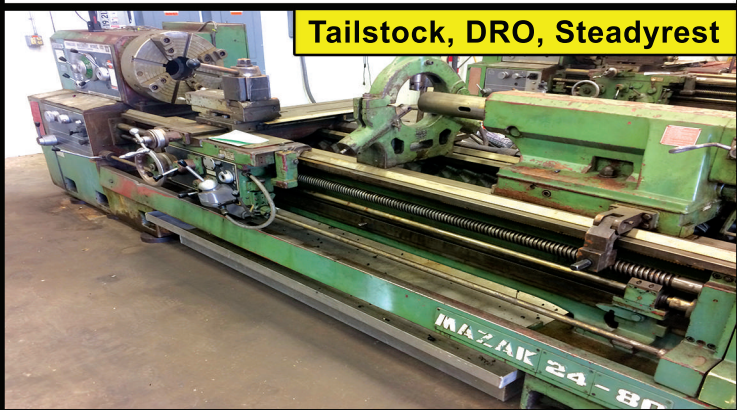
Tailstock, DRO, Steadyrest