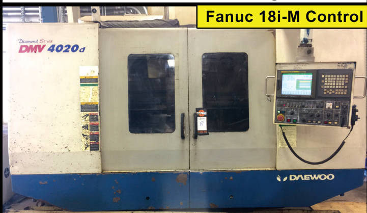
Fanuc 18i-M Control