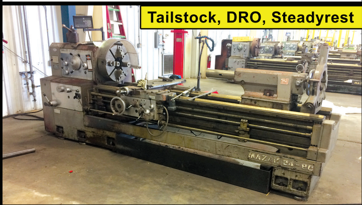
Tailstock, DRO, Steadyrest