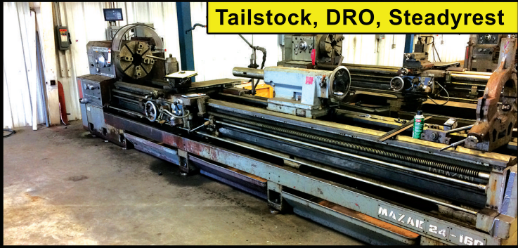
Tailstock, DRO, Steadyrest