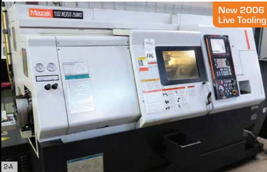
New 2006 Live Tooling